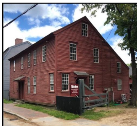
Penhallow House (c. 1750) was moved to its current location on Washington Street in 1862.