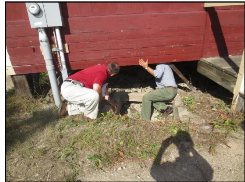
It's time to inspect your LCHIP supported resource and submit a monitoring report!

Thank you to the many stewards who have already completed and submitted their reports.