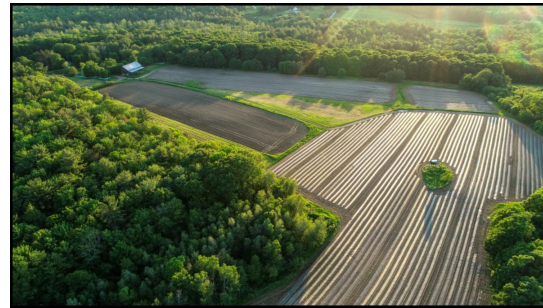
Pearl Farm in Loudon on a gorgeous summer day.

The 279-acre Pearl Farm sits on Loudon Ridge, the most rural and scenic part of the town of Loudon, and its agricultural heart. A 2019 LCHIP grant will help The Trust for Public Land partner with the Loudon Conservation Commission to conserve the farm, allowing a fourth generation of the Pearl family to continue to produce hay, squash, pumpkins, sweet corn, and maple syrup for nearby farm stands, regional supermarkets, and maple syrup wholesalers. Visit the farm for their Maple Weekend Open House on March 21 & 22.