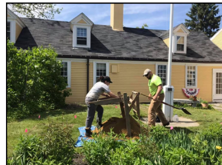
LCHIP encourages contacting a qualified archaeologist whenever a rehab project involves ground disturbance.

Information can be found on their website or Facebook page and is frequently updated.