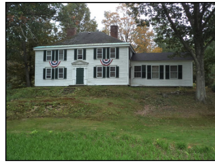
With the support of recent LCHIP grant, the Hinsdale House will receive a much needed new roof.

Special note: The Saving Special Places 2020 land conservation conference includes a workshop about protecting historic resources while meeting land conservation goals, meshing perfectly with LCHIP's recognition that a variety of resources define the special places of our state