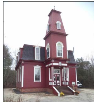
Milton Free Public Library

Meanwhile, in Washington, Town officials and volunteers finished their outstanding LCHIP-funded project on their 1787 meetinghouse , a project that involved rehabbing dozens of windows and some exterior doors. The LCHIP grant, awarded in 2017, was for $75,240.