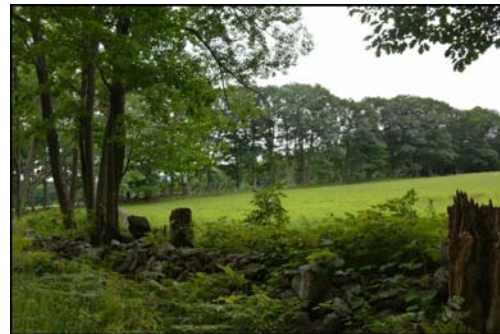
Abbottville Farm, Fracestown