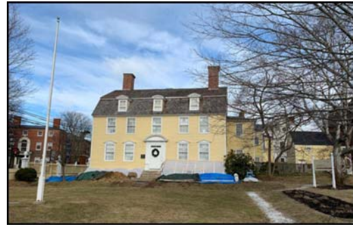
John Paul Jones House, Portsmouth