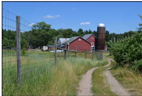
Sullivan Farm, Nashua