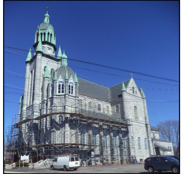
Repairs are under way at the St. Mary and Archangel Michael Church in Nashua.

In 2017, LCHIP awarded a grant to help repair the soaring - and cracked - west stone façade and towers. Now, church leaders are working with a national nonsectarian nonprofit organization, Partners for Sacred Places , to build capacity as they take on this ambitious project. With the help of this collaboration, the monumental edifice on French Hill should endure as an historic and architectural landmark for years to come.