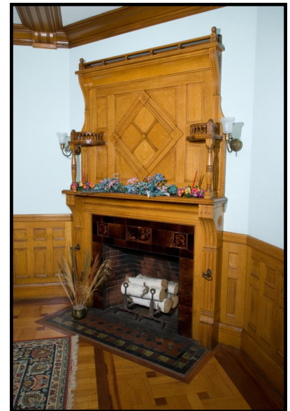
Dining room fireplace located in the Littleton Community Center, site of LCHIP's April 30 historic resource grant workshop

We look forward to seeing the interesting new projects seeking LCHIP support this year.