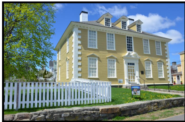
Wentworth-Gardner House, Portsmouth

Located in the historic South End of Portsmouth , the Wentworth-Gardner House (1760) is a classic example of American Georgian architecture and has been a museum for over a century and a National Historic Landmark since 1969. The stewards, Wentworth-Gardner and Tobias Lear Houses Association, just wrapped up work supported by LCHIP and recommended in a 1995 Historic Structure Report. This included repairing and repainting windows, woodwork and ceilings as well as repairing exterior stonework and the apron that surrounds the building. Thanks to this project, the house more accurately reflects its original appearance and is better preserved for the future. Read more about its history here .