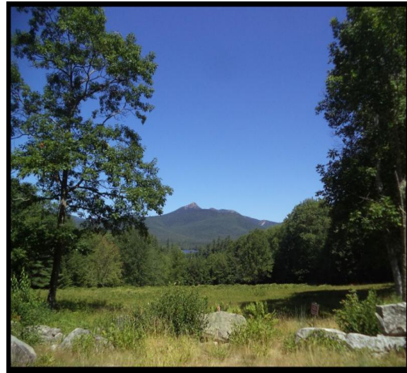
Recently conserved view of Mount Chocorua from Route 16 in Tamworth.

For many New Hampshire residents and visitors, the view of Mt. Chocorua across the Chocorua Lakes stirs memories of long-ago family vacations spent road-tripping through the White Mountains, camping at White Lake State Park , or leaf-peeping in the fall. The quintessential view of New Hampshire's glory from Rt. 16 is so picturesque that it was chosen to represent the White Mountain National Forest on the U.S. Mint's 2013 "America the Beautiful" quarter . The mountain is often touted as the most photographed in the world and its distinctive bald peak can be seen from many points throughout New Hampshire and western Maine.