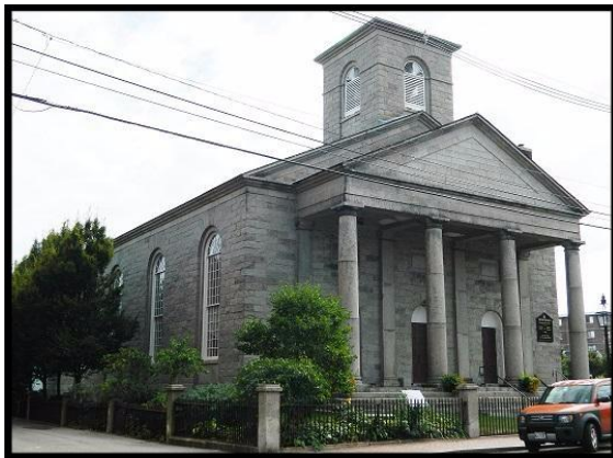
South Church, Portsmouth

Portsmouth's historic South Church has a more sure-footed path into the future thanks to a planning study recently concluded with the help of an $8,000 LCHIP grant. The congregation is one of New Hampshire's oldest - gathered in 1623 - and it boasts one of the state's most monumental examples of Greek revival architecture, a sanctuary constructed in 1826 with massive granite walls and a classically detailed portico. Mounting maintenance concerns prompted the congregation to seek professional guidance in prioritizing likely upcoming projects, including repairs to its historic slate