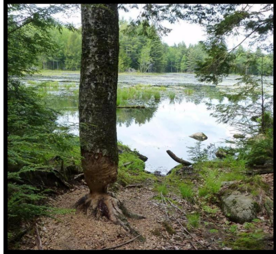
Fresh beaver activity along the shore of a remote pond in Collins Brook Headwaters.

With help from a $60,000 LCHIP grant, the partnership recently conserved an additional 100 acres, adding to its long list of accomplishments. The newly conserved land contains headwater streams of Collins Brook, frontage on two remote ponds, wet meadow/shrub wetlands, and several vernal pools. It is considered some of the most prolific wildlife habitat in the Monadnock Region.