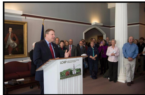
Governor Sununu addresses the 2017 grant recipients.

2017 Grant Recipients . We'll tell you more about these projects in the 2018 LCHIP Links newsletters.