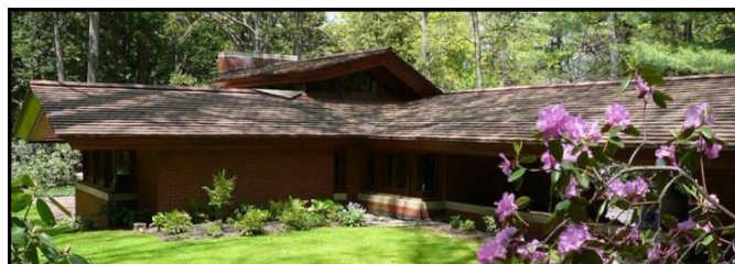
Zimmerman House, Currier Museum of Art, Manchester.

May is National Preservation Month, a great time to plan a visit to a favorite historic site or explore one that has always intrigued you.