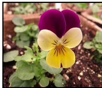
Sullivan Farm offers high quality, hand raised plants.

will use a $213,000 LCHIP grant to help place a conservation easement on the land supporting its ongoing agricultural use.