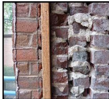
1970's brick veneer is being removed to re-expose the original more elaborate 1904 brick exterior.

Rochester's 1904 fire station was built in the latest elaborate style, Romanesque Revival. As time passed and firefighting equipment changed, the uses of the building changed too. When it was repurposed into a police station in the 1970s, it was "modernized" with simplified windows and a veneer of less elaborate brick work. By the early 2000's, the building had been vacated and was deteriorating to an eyesore and target of vandalism. Much to their credit, leaders of the City of Rochester have re-imagined the building as a useful Annex to City Hall. The inside will be totally rebuilt as modern office space. A $18,702 2016 LCHIP grant is helping with restoration of the original and more elegant windows and exterior brickwork.